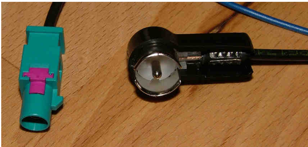
Fig. 3: adapter cable to connect a DVB-T-receiver to the car's roof antenna (cellphone preparation or DAB)